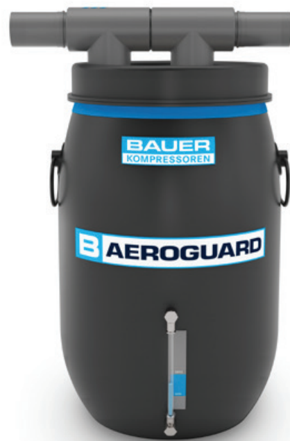
AERO-GUARD-OX CO 2 -Absorber

NEW! As an option, a lever can be used in conjunction with B-DETECTION PLUS to precisely adjust the CO 2 reduction – thereby extending the filter's service life.