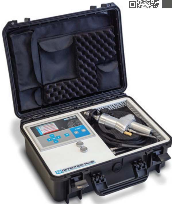
B-DETECTION PLUS m

The sensors can be calibrated semi-automatically.