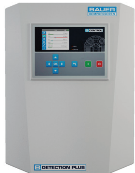
B-DETECTION PLUS s