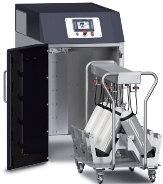
B-SAFE 300 filling device

The rugged steel safety module provides protection from severed or detached filling hose connections and cylinder explosions during filling. The doors are automatically locked during filling.