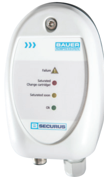
B-SECURUS: Uses a “traffic light” system to track remaining filter cartridge life

The B-SECURUS system does not require calibration.