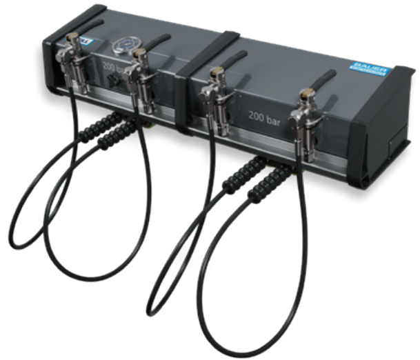
BAUER filling panel B-FILL

For optional control and monitoring of the system, a B-CONTROL MICRO can be installed in an additional B-FILL module. Any number of B-FILL modules can be combined, allowing you to create the perfect filling panel for your requirements.