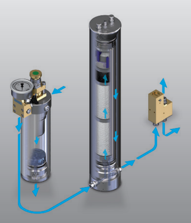
BAUER P-Purification System