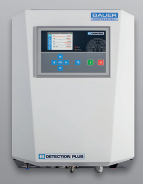
Gas measuring system B-DETECTION PLUS