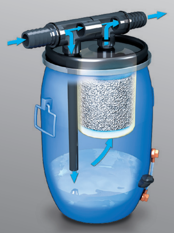
AFRO-GUARD for CO2 reduction