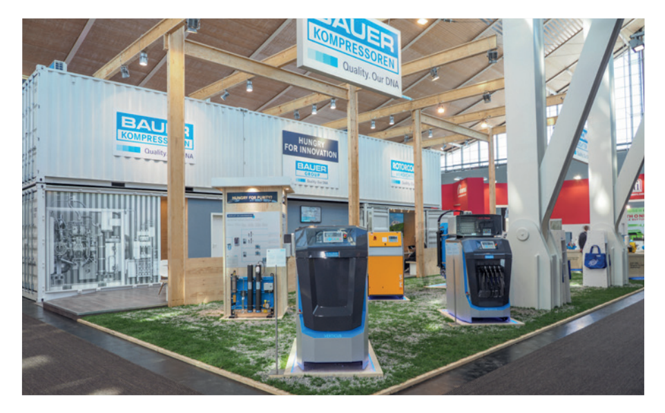
Green turf replaced plastic, and chipboard panels were abandoned in favour of reusable containers. Visitors were unanimous in their praise of the sustainable and innovative design of BAUER's stand at this year's ComVac trade show.

ment focused on the concept of pure breathing air –and more precisely, the new PureAir Gold certification.