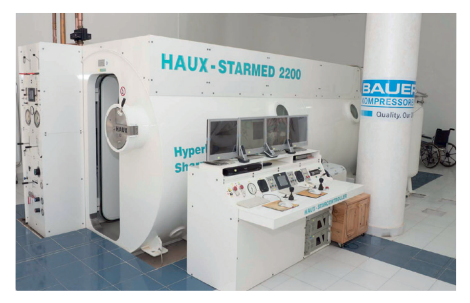
The new Haux hyperbaric chamber has more than doubled the centre's treatment capacity since 2011.

The BAUER GROUP, established in Munich in 1946, is represented around the world with 40 subsidiaries and sales offices. With 1,200 employees, it generates global sales of approx. EUR 300 m. With exports accounting for 90 per cent of sales, BAUER is the global market leader in high- and medium-pressure compressors. Its product portfolio spans breathing air compressors; gas injection technology (GIT) for plastic injection moulding; natural gas, biogas and H<sub>2</sub> fuelling stations; and compressor systems for all industrial applications and segments. After ratification of the provisions of the Paris Agreement, fuelling stations for natural gas, biogas and hydrogen are expected to boom, particularly in industrialised countries.