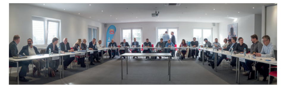
BAUER partners from all over the world met up in Munich at the now-traditional A Partners' Meeting, took part in training courses and exchanged information and experienced.

Now divers can look forward to even greater freedom with the new POSEI-DON EDITION PE 200 TB compressor,