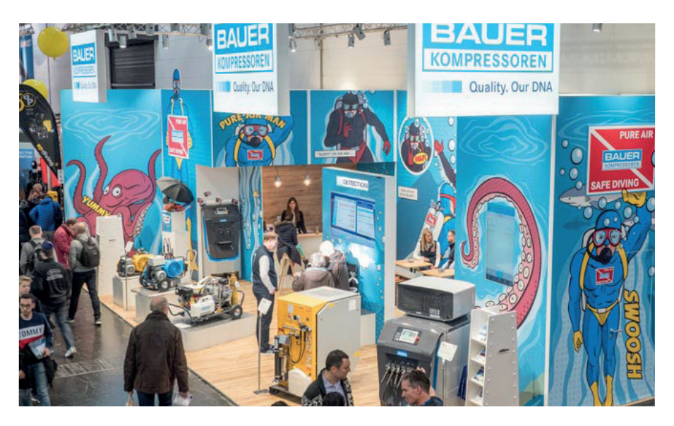
Featuring a bold, eye-catching coming style, the BAUER stand at the trade show presented the benefits of breathing air quality.

As every year, Thursday evening at boot Düsseldorf was reserved for the Dive Awards. Everyone who is anyone in the diving scene always saves this date – the annual highlight of the exhibition. This year, BAUER's sponsorship commit-