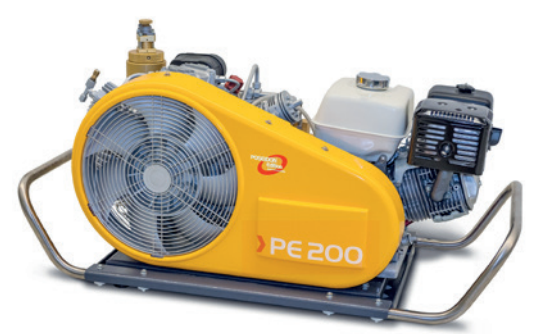
Die neue leistungsstarke PE-TB-Anlagenreihe gibt maximale Mobilität.

which BAUER KOMPRESSOREN will premiere at the 2019 boot trade show.