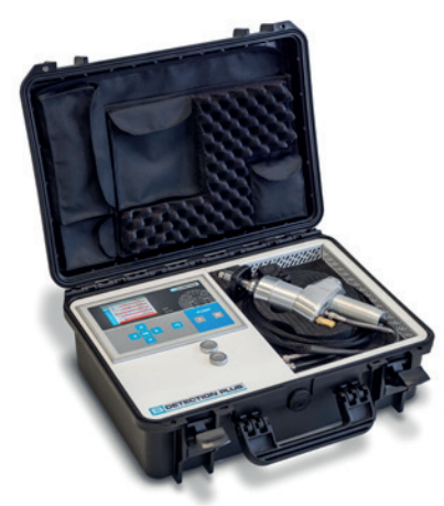
B-DETECTION PLUS m – the mobile solution for reliable breathing air measurement

The battery capacity covers a minimum of 5 hours of measurement. The longlife lithium iron polymer battery was chosen for its exceptionally high cycle count.